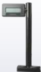
Multiple options available in English or Metric units