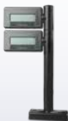
Multiple options available in English or Metric units